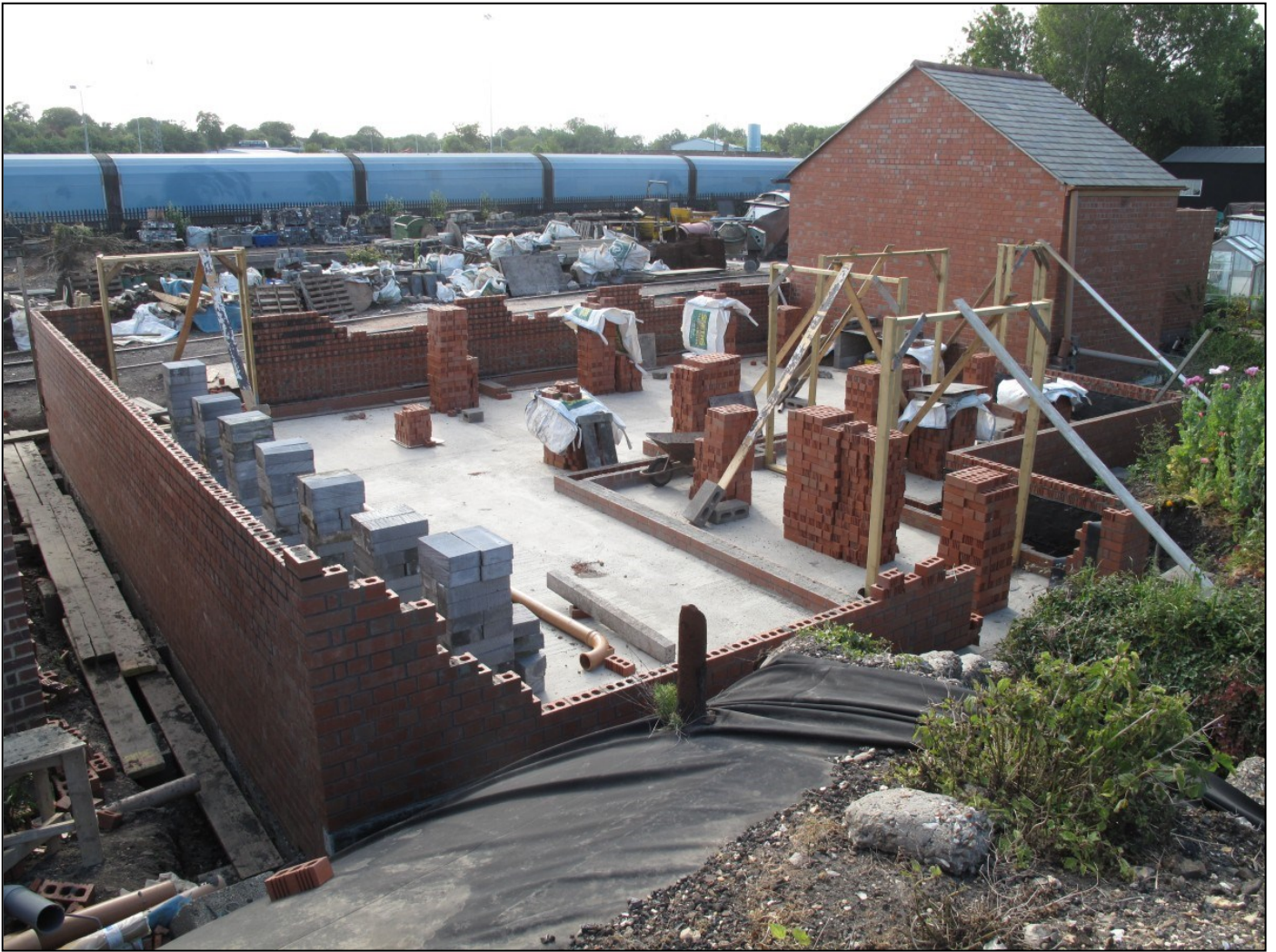
Above: The building site in June 2015. Below: SPS visits another signal box.