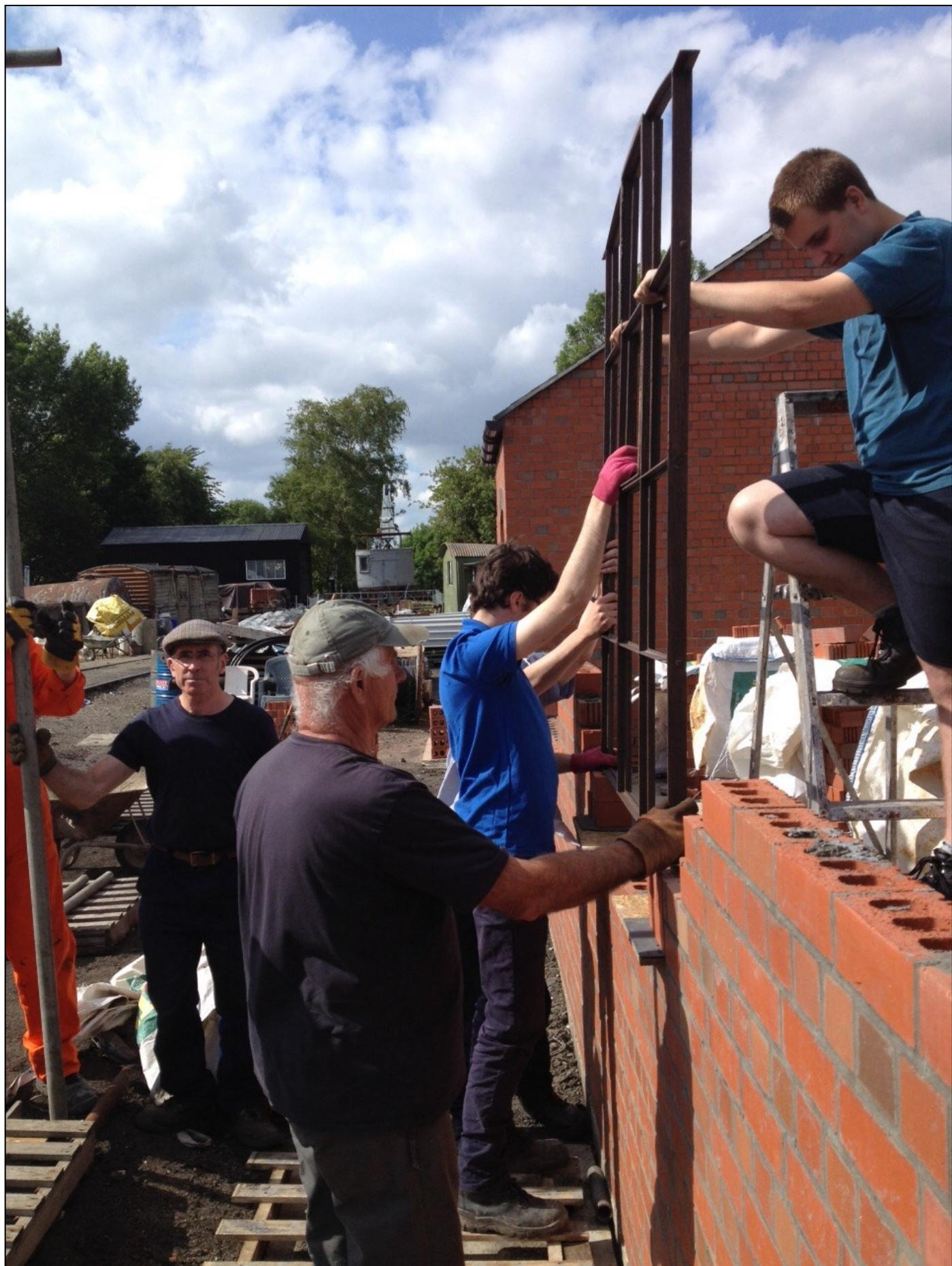
Fitting the first windows in June 2015. The windows were recovered from the old railway buildings at the from of Didcot Parkway station.